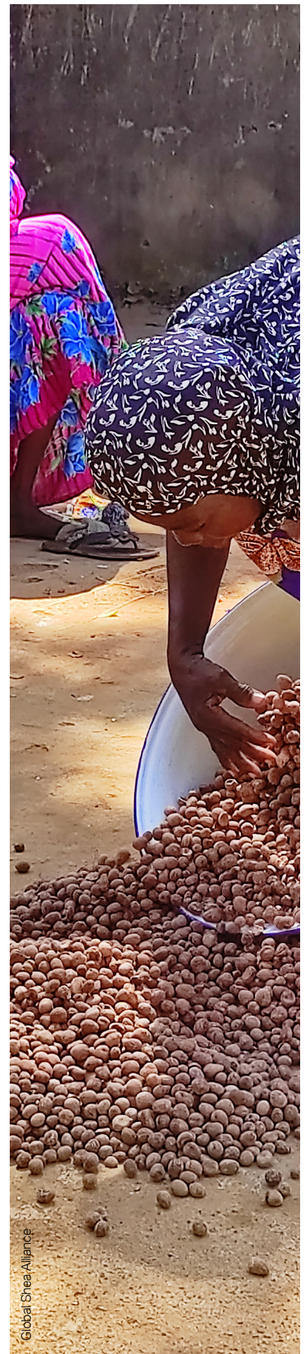
Global Shea Alliance