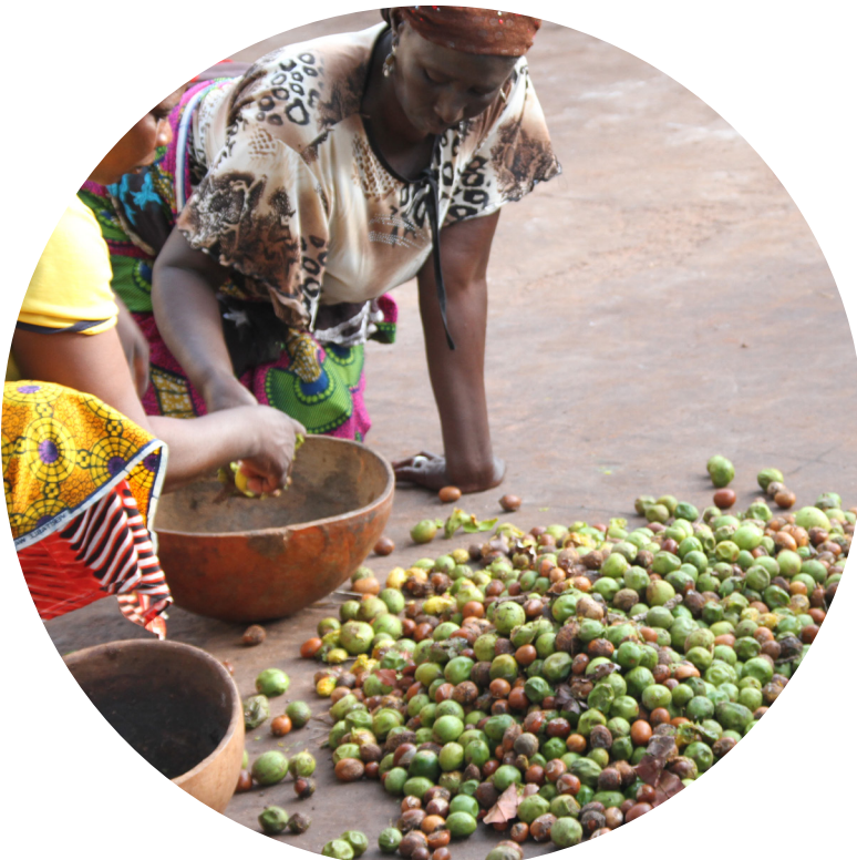
Global Shea Alliance